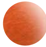
21 - Copper