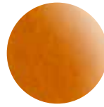
12 - Ducat Gold